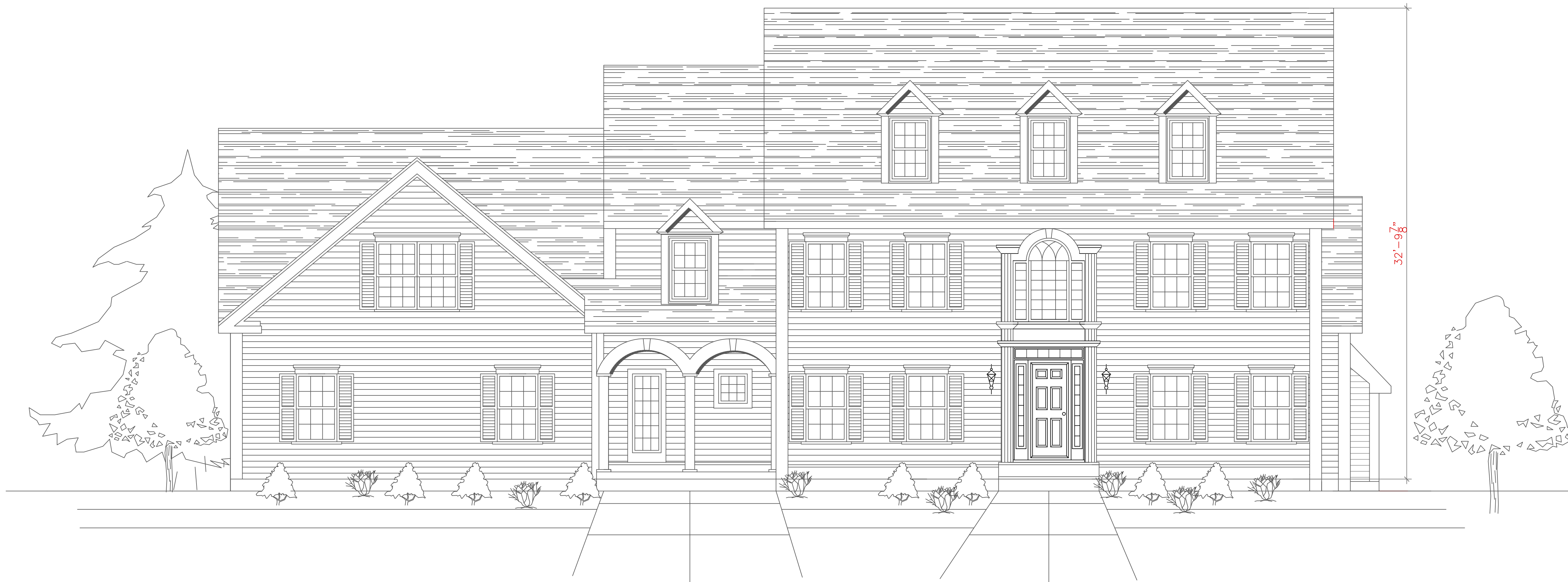
FRONT ELEVATION (4130 s.f. TOTAL)